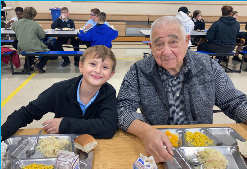
Students at TCCES had lunch with veterans on Friday, November 12.

Veterans day honors all those who have served our country and those who lost their lives to protect us from dangers around the world.