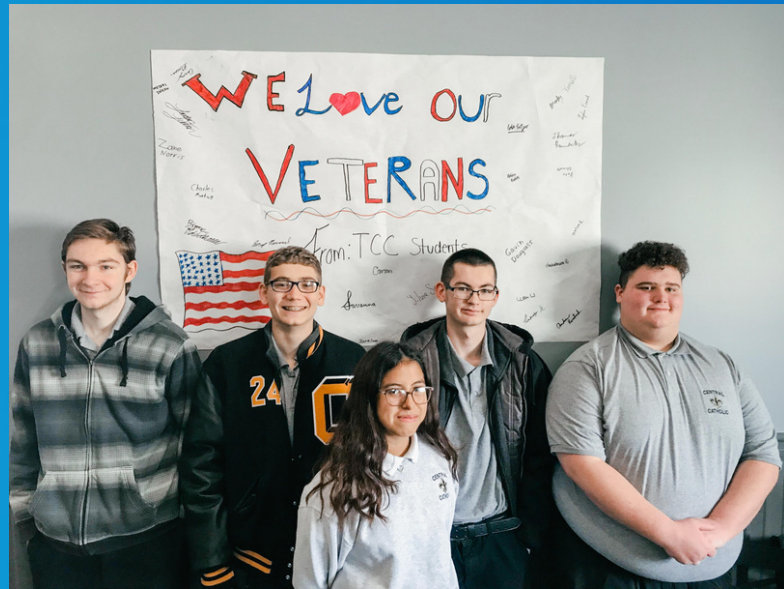
The Sophomores made a poster for Veteran's Day.